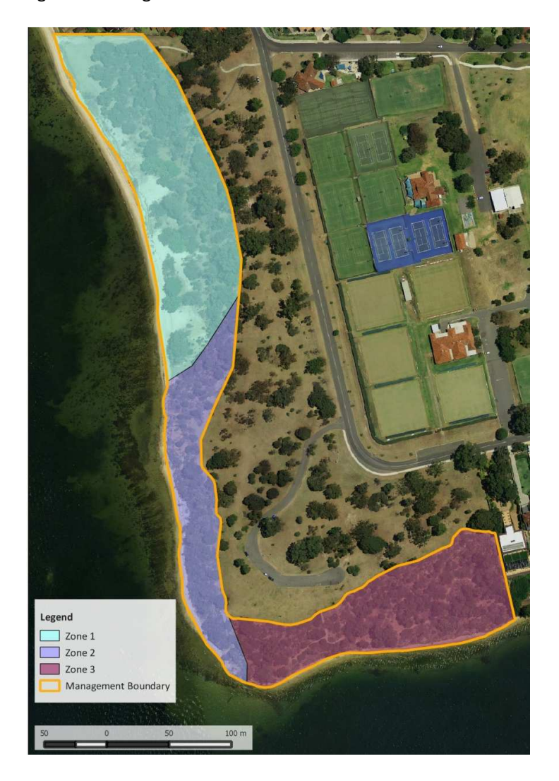
Figure 3: Management Zones at Point Resolution.

In the 1991 and 2003 – 2009 Management Plan the bushland was divided into 3 Zones. These 3 Zones form the basis of general management and are intended to facilitate the establishment of guidelines for managing areas of similar terrain and degradation. Specific sites are targeted areas for rehabilitation within Zones. They demarcate the extent of areas where specific works should occur. Zones 2 and 3 are considered the highest priority areas for management. Zone 1 is not rated as highly for management due to it being generally degraded and lack of available resources to rehabilitate this Zone.