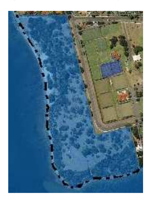
Figure 2: Swan River Trust Development Control Area Point Resolution

The SRT, the City of Nedlands and the Friends of Point Resolution have cooperatively managed Point Resolution since the late 1990's. In recent years Point Resolution has received significant funding through the SRT's Riverbank Funding Program for restoration along the western and southern foreshore and embankment areas.