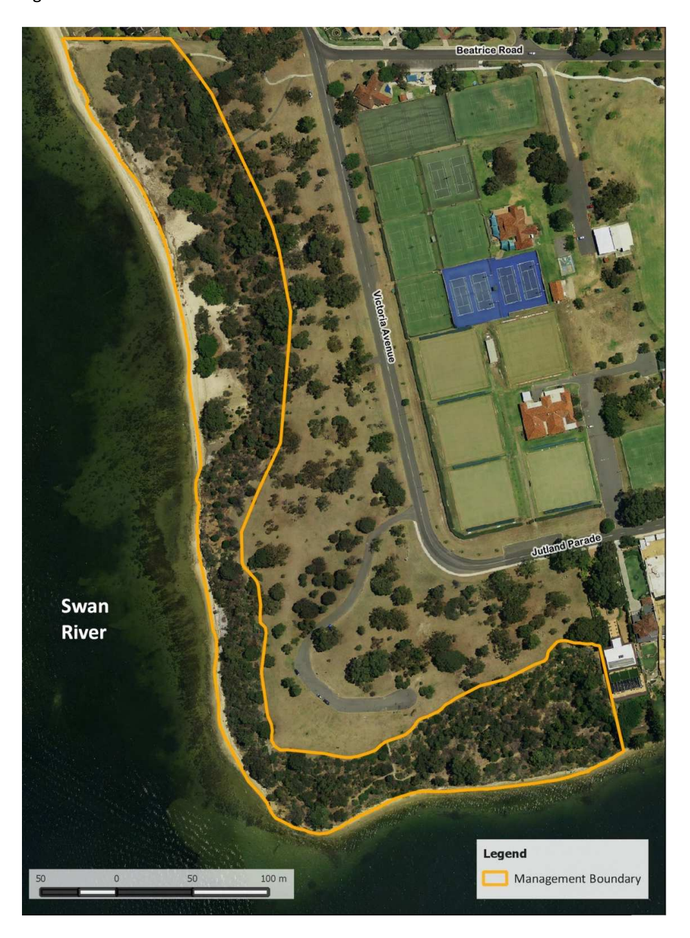
Figure 1: Point Resolution Reserve

Point Resolution is located on the northern shores of the Swan River at the junction of Victoria Avenue and Jutland Parade, in Dalkeith. The entire Reserve includes bushland and parkland areas which cover an area of 9Ha. The focus of this Management Plan is on the management of the bushland area which covers 4 hectares (Ha). The bushland at Point Resolution is bordered by the Swan River to the south and west, residential houses to the north and southeast and parkland to the east. It is located within the City of Nedlands approximately 9 km west south west of the Perth CBD, as shown in Figure 1.