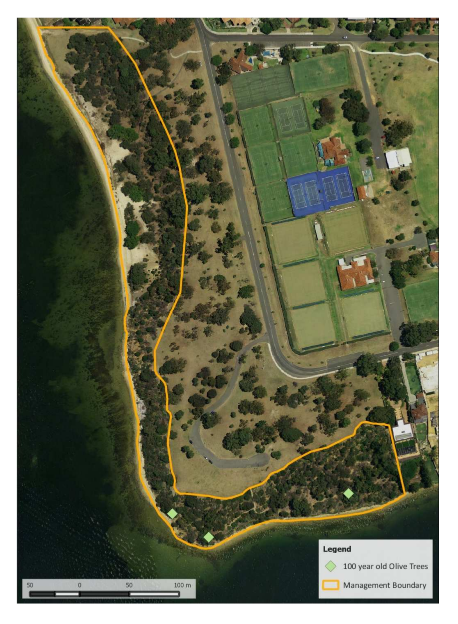
Figure 4: Three 100 Year Old Olive Trees

Olives are a high priority weed species. In the 2003 – 2009 Management Plan the retention of three 100 year old Olive trees was recommended due to their heritage value. The retention of these trees causes an ongoing management issue as a result of the germination of many seedlings each year. Regardless of this, these three Olive trees should be retained with ongoing monitoring and removal of seedlings as required. The location of the three 100 year old Olive trees are shown in Figure 5.