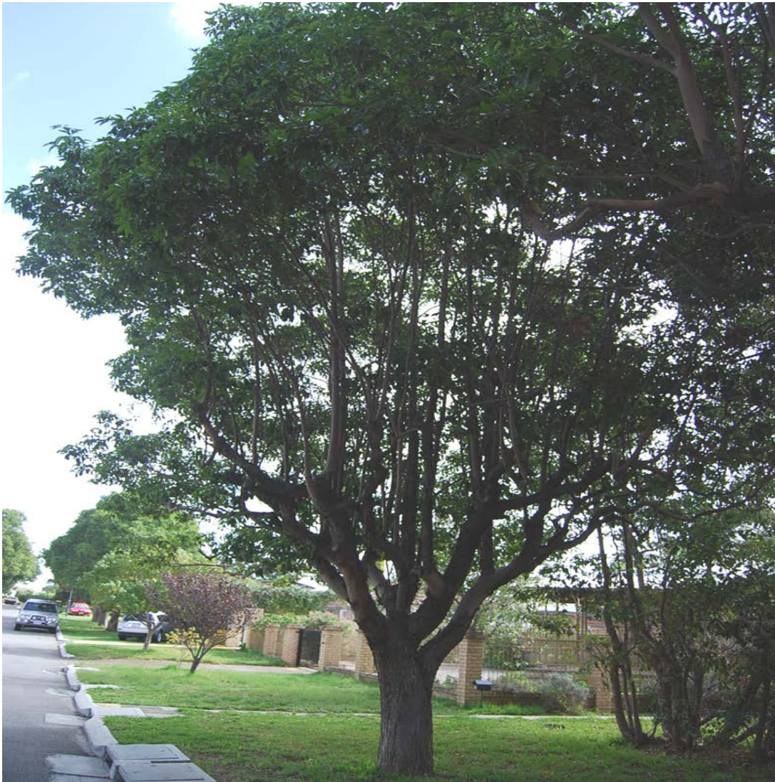
Figure 1 – Tree proposed for removal

Administration supports the proposal on the basis the Queensland Box tree has a limited expected life span and was assessed during the street tree audit as having an average to indifferent overall form.