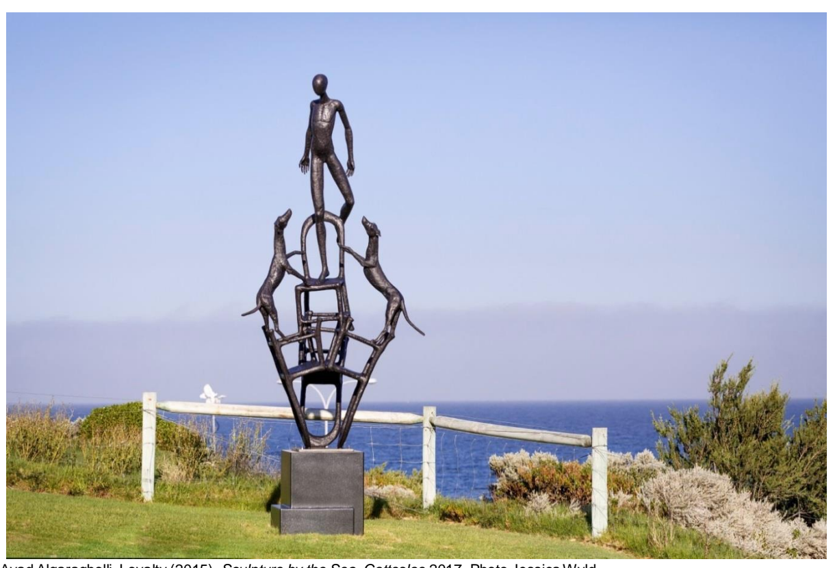
Ayad Alqaragholli, Loyalty (2015), Sculpture by the Sea, Cottesloe 2017.