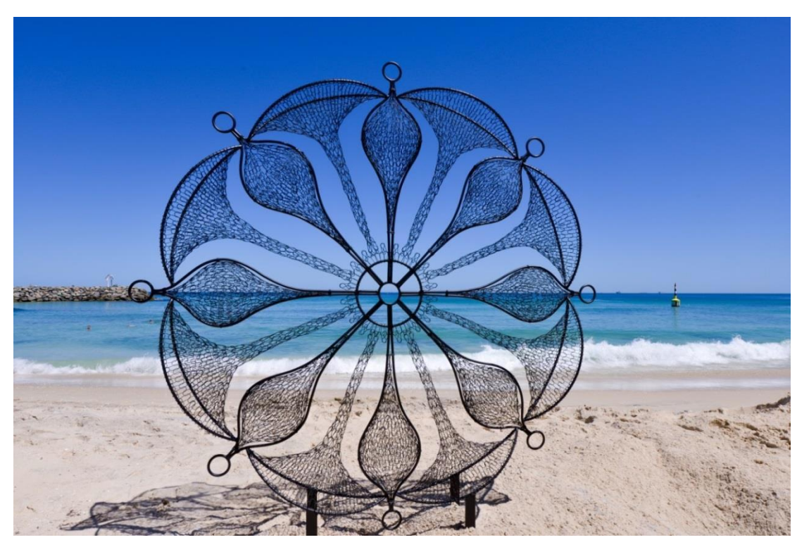
Tania Spencer, Inspired by Rosie (2018), Sculpture by the Sea, Cottesloe 2018.