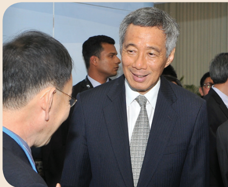
OPENING CEREMONY & WELCOME RECEPTION

Networking events – from official receptions to more informal gatherings – connect delegates with the who's who in the business of integrated urban solutions.