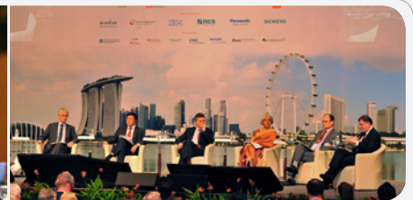
WORLD CITIES SUMMIT KEYNOTE PLENARY