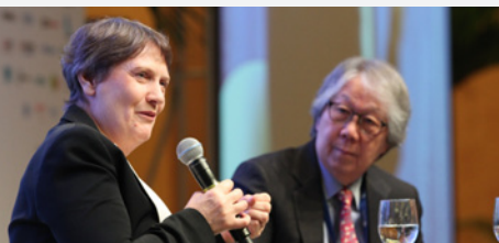
IN CONVERSATION AT OPENING PLENARY