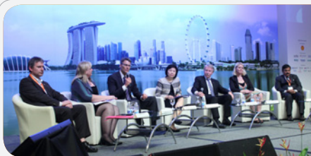
LEE KUAN YEW WORLD CITY PRIZE FORUM