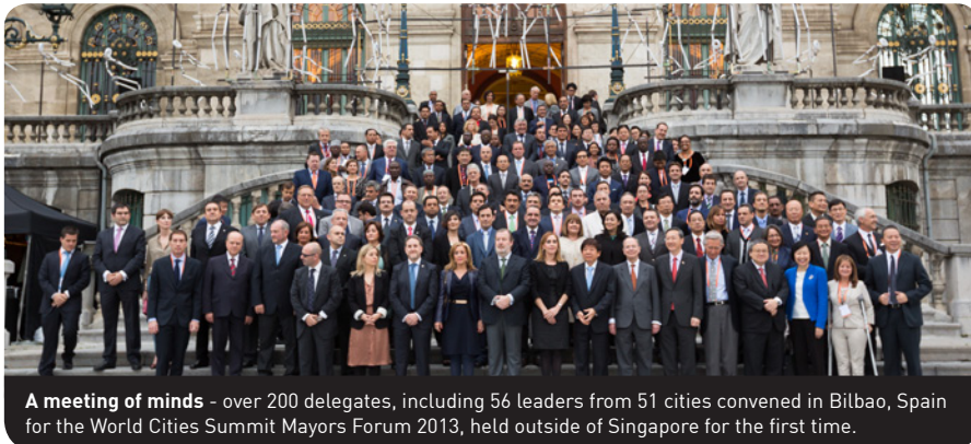
A meeting of minds - over 200 delegates, including 56 leaders from 51 cities convened in Bilbao, Spain for the World Cities Summit Mayors Forum 2013, held outside of Singapore for the first time.