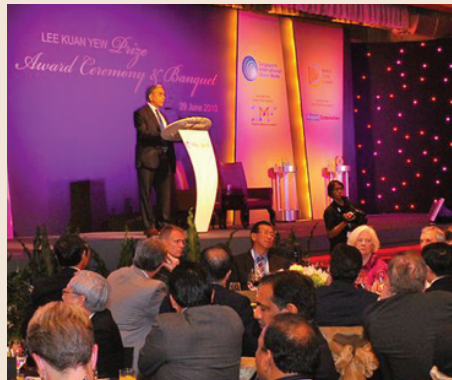
LEE KUAN YEW PRIZE AWARD CEREMONY & BANQUET