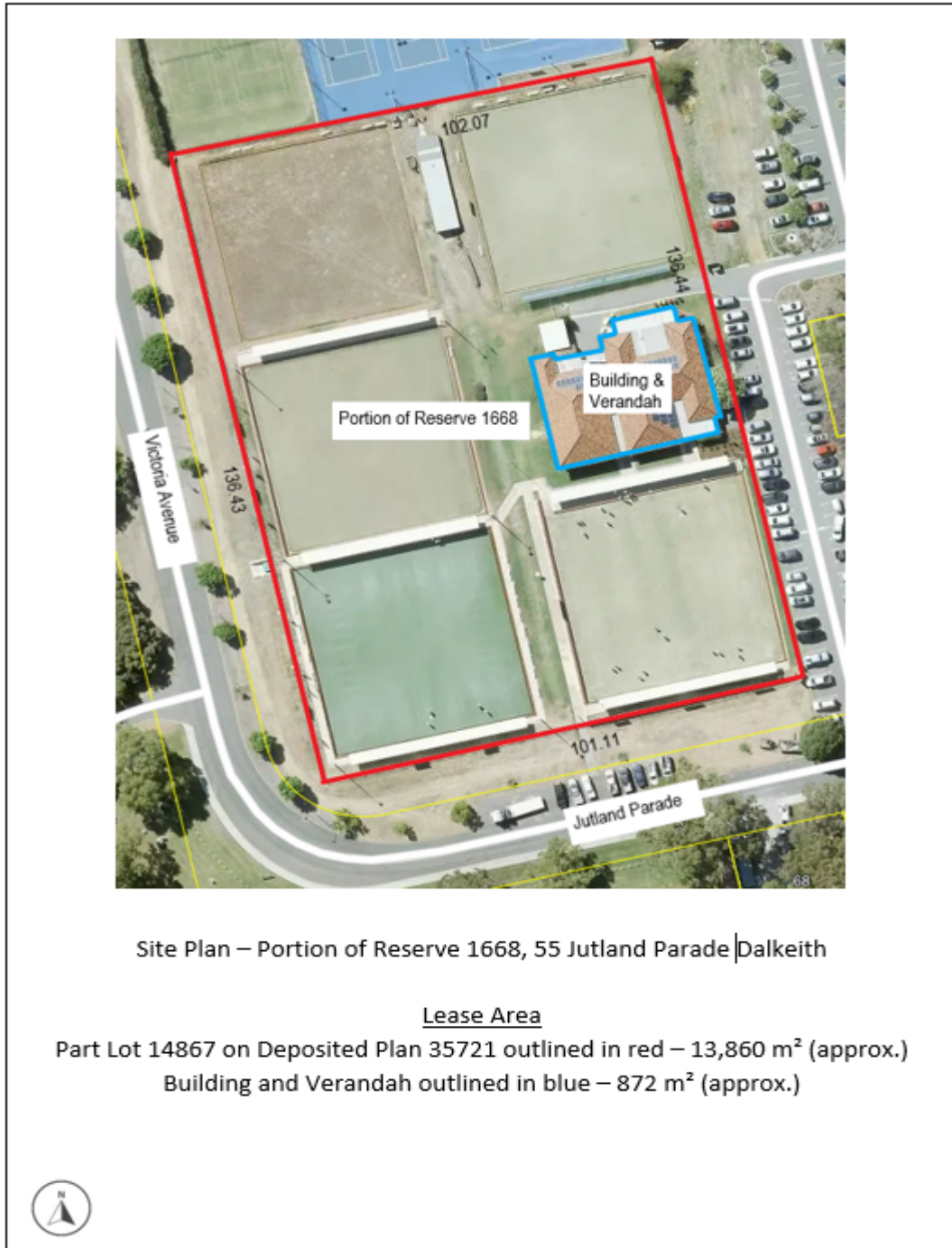
Site Plan – Portion of Reserve 1668, 55 Jutland Parade | Dalkeith