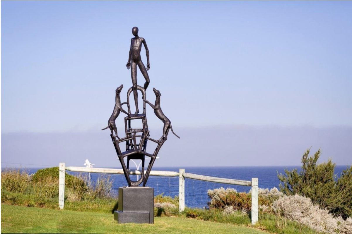
Ayad Alqaragholti, Loyalty (2015), Sculpture by the Sea , Cottesloe 2017.