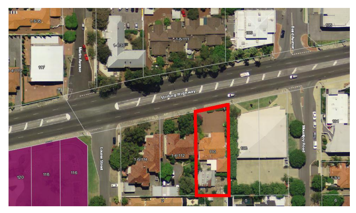
Figure 1 – Locality Plan

The existing development on-site is an office in a single storey building which has the external appearance of a residential dwelling. There is also a large outbuilding to the rear, which is earmarked for demolition.