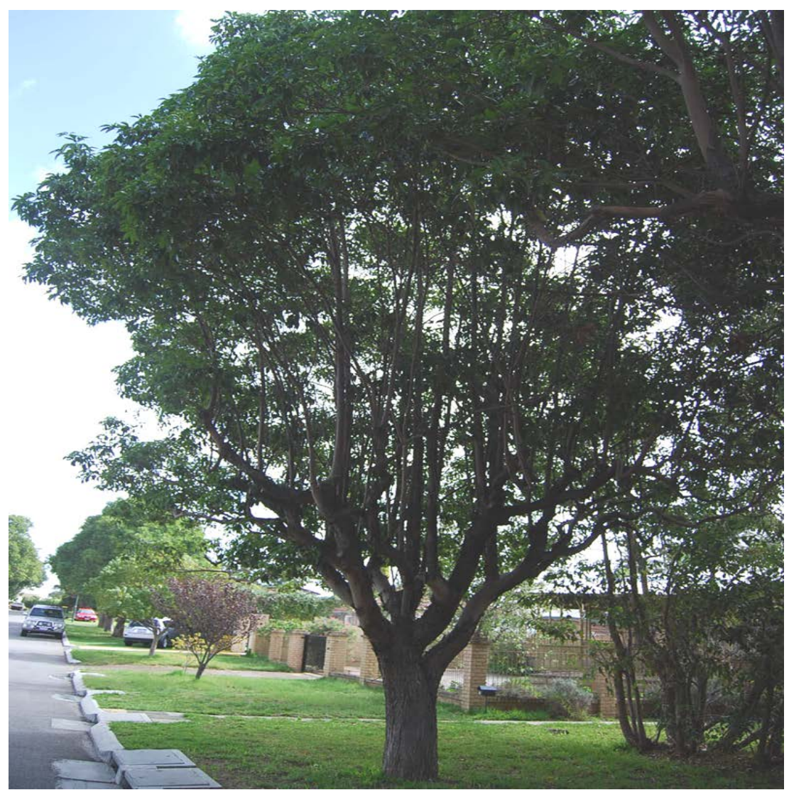
Figure 1 – Tree proposed for removal

Administration supports the proposal on the basis the Queensland Box tree has a limited expected life span and was assessed during the street tree audit as having an average to indifferent overall form.