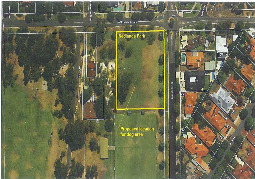
Figure 2 – Nedlands Park