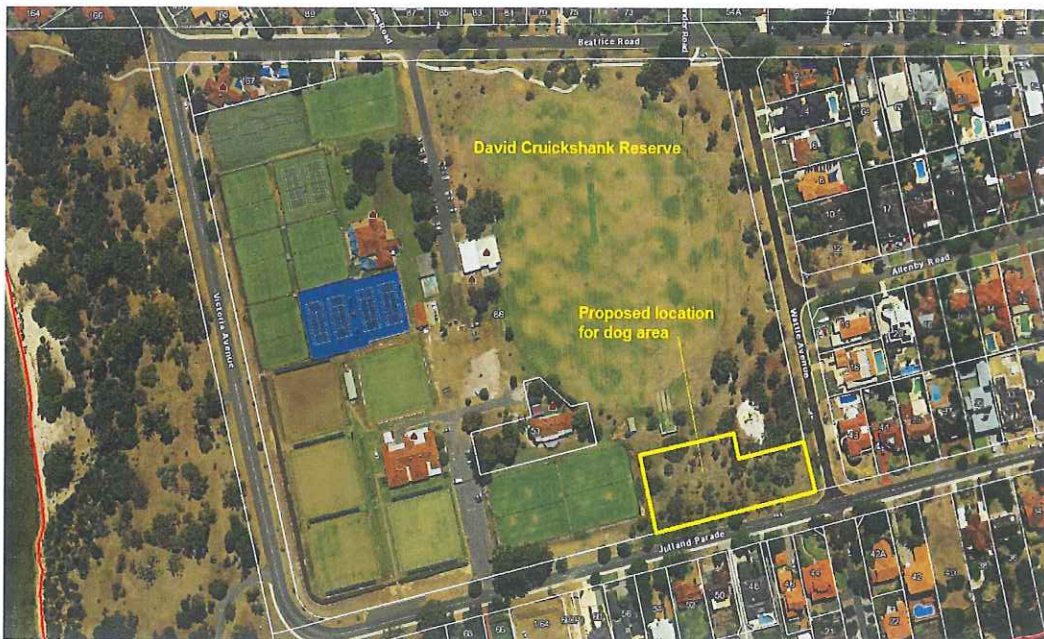
Figure 1 – David Cruickshank Reserve

There are a number of formal parking areas as well as ample informal verge parking at the reserve. This reserve is currently the subject of a master planning process and the inclusion of a fenced dog park could be included for consideration within the scope. There is currently a suitably sized area towards the south-eastern side of the park that is not fully utilised. The preferred location would be as indicated in Figure 1.