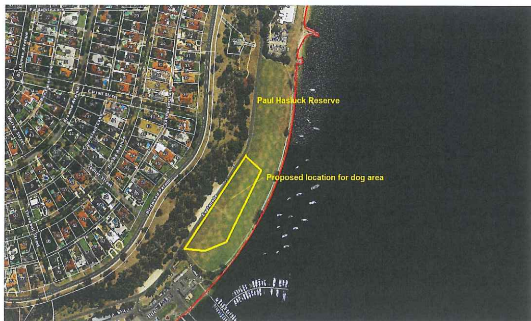
Figure 3 – Paul Hasluck Reserve

There is ample parking in the partially formalised limestone parking area. The site has no trees providing shade and would require a considered planting strategy. The existing sports lighting that is currently non operational could be reinstated and utilised for evening visitations until 10pm. To establish the facility in this location would need approval from the Swan River Trust. The implications to the adopted Foreshore Enhancement and Management Plan would need consideration. The proposed location would be as indicated in Figure 3.