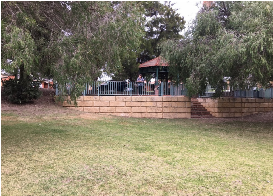
Image 1 (above): Baines Park gazebo and community infrastructure area