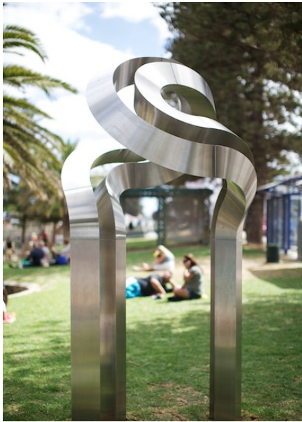
Mitsuo Takeuchi JAPAN

TITLE Transfiguration 'engage' VII (2013)