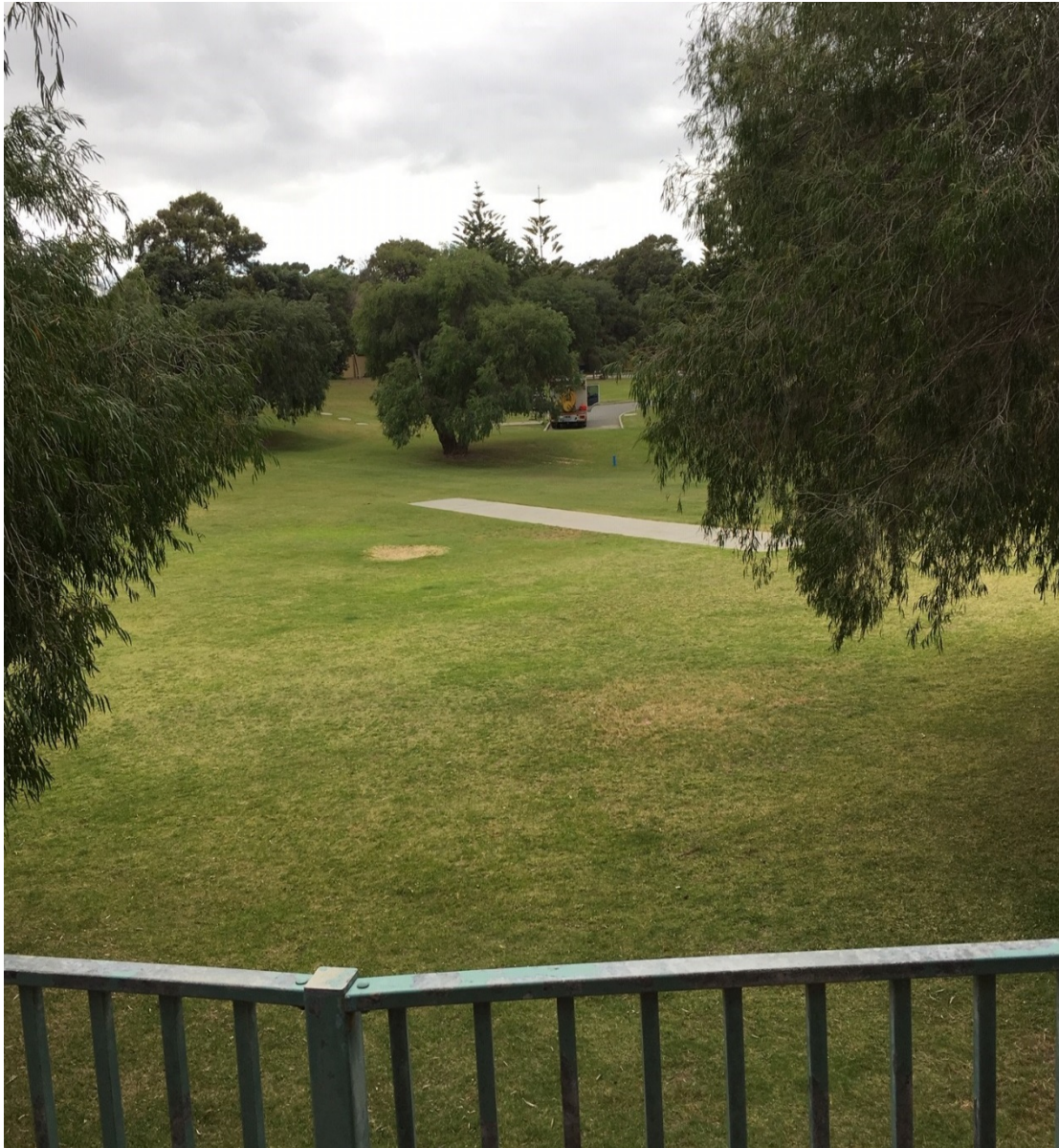
Image 2 (above): Vista across Baines Park from raised community facilities are