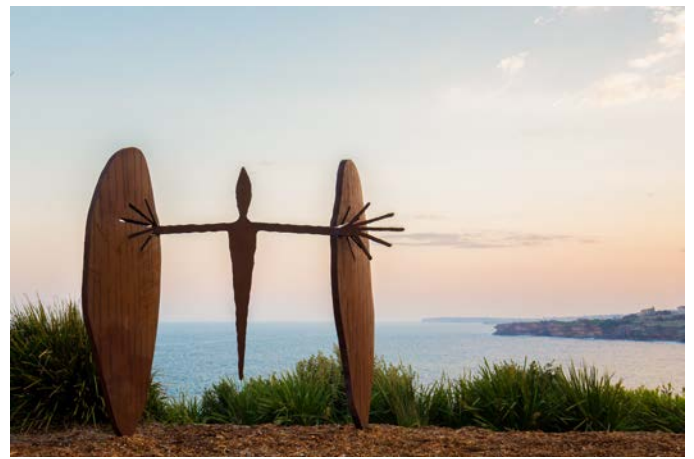
Greg Johns SA

EXHIBITED Sculpture by the Sea, Cottesloe 2014