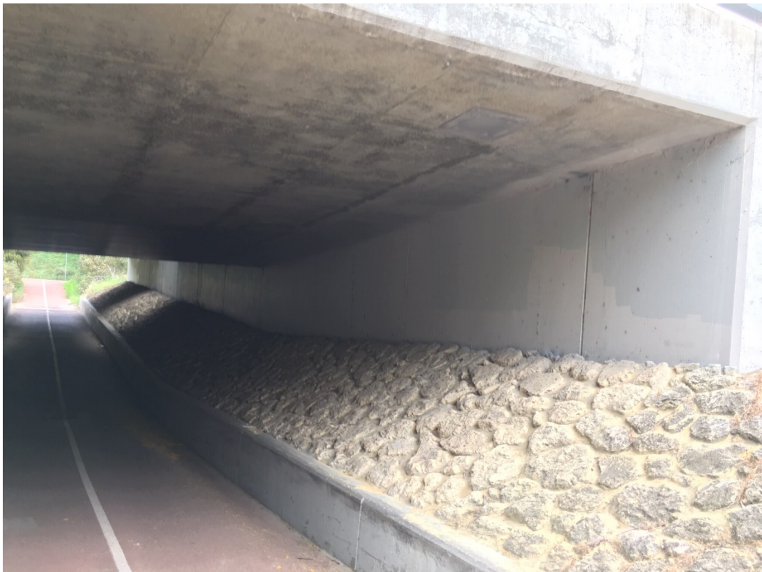
Image 2 (above): wall showing partially-covered graffiti painted over