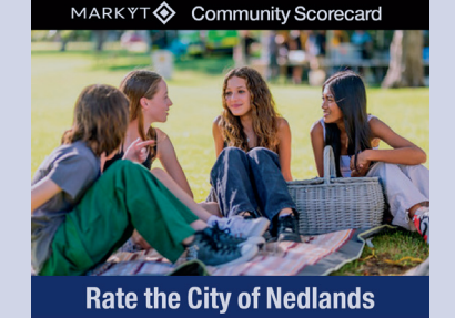
CATALYSE S (Sity of Nedlands