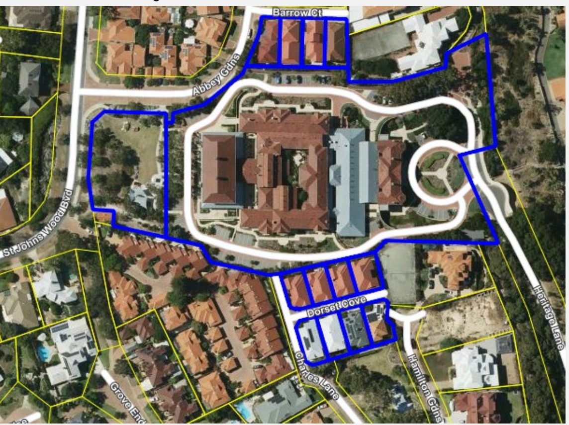
Figure 1: Policy area in blue

1.1 The purpose of this Policy is to provide guidance and development provisions for lots within the Old Swanbourne Hospital Precinct, located in and around Lot 416 (No.1) Heritage Lane, Mount Claremont, as shown in Figure 1.