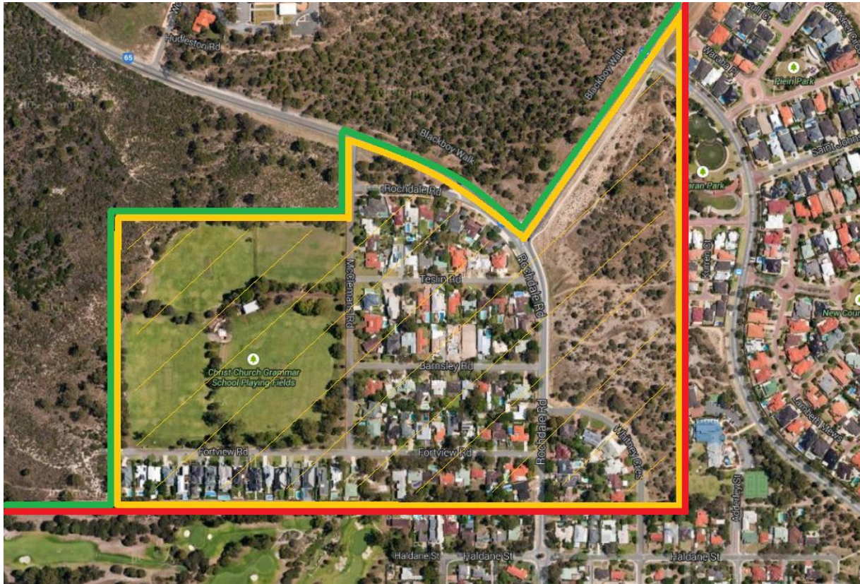
Map 1 – Variation of the boundary of the district of the City of Nedlands to align with the proposed City of Subiaco boundary, so as to include within it the entire suburb of Mount Claremont (illustrated by the yellow boundary).